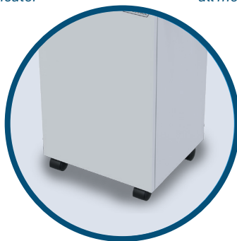
Rugged All-Metal Cabinet Includes casters for mobility