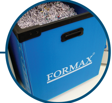
Durable Waste Bin Lifetime guaranteed rugged molded plastic for durability