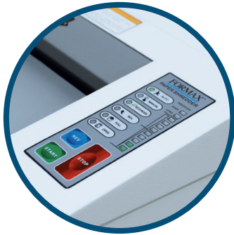
User-friendly Control Panel Auto Start/Stop/Reverse, Full Bin Indicator, Load Indicator

The FD 8300HS High Security Deskside Shredder offers P-7 security in a compact, rugged design that fits right under a desk to shred classified documents. Evaluated by the NSA to meet the requirements of NSA/CSS specification 02-01 for P-7 high security cross-cut shredders, its continuous-duty motor shreds up to 23 feet per minute , with a shred size of 1/32" x 3/16" . Commercial-grade features include heat-treated steel blades , a steel cabinet on casters , lifetime guaranteed waste bin , energy-saving ECO mode , and an LED control panel . The optional EvenFlow™ Automatic Internal Oiling System helps to keep the FD 8300HS in peak operation.