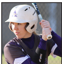
Player/Hitter of the Year