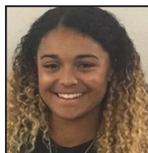
Freshman of the Year