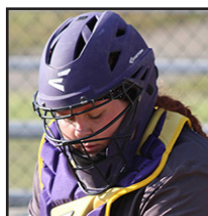
Newcomer of the Year