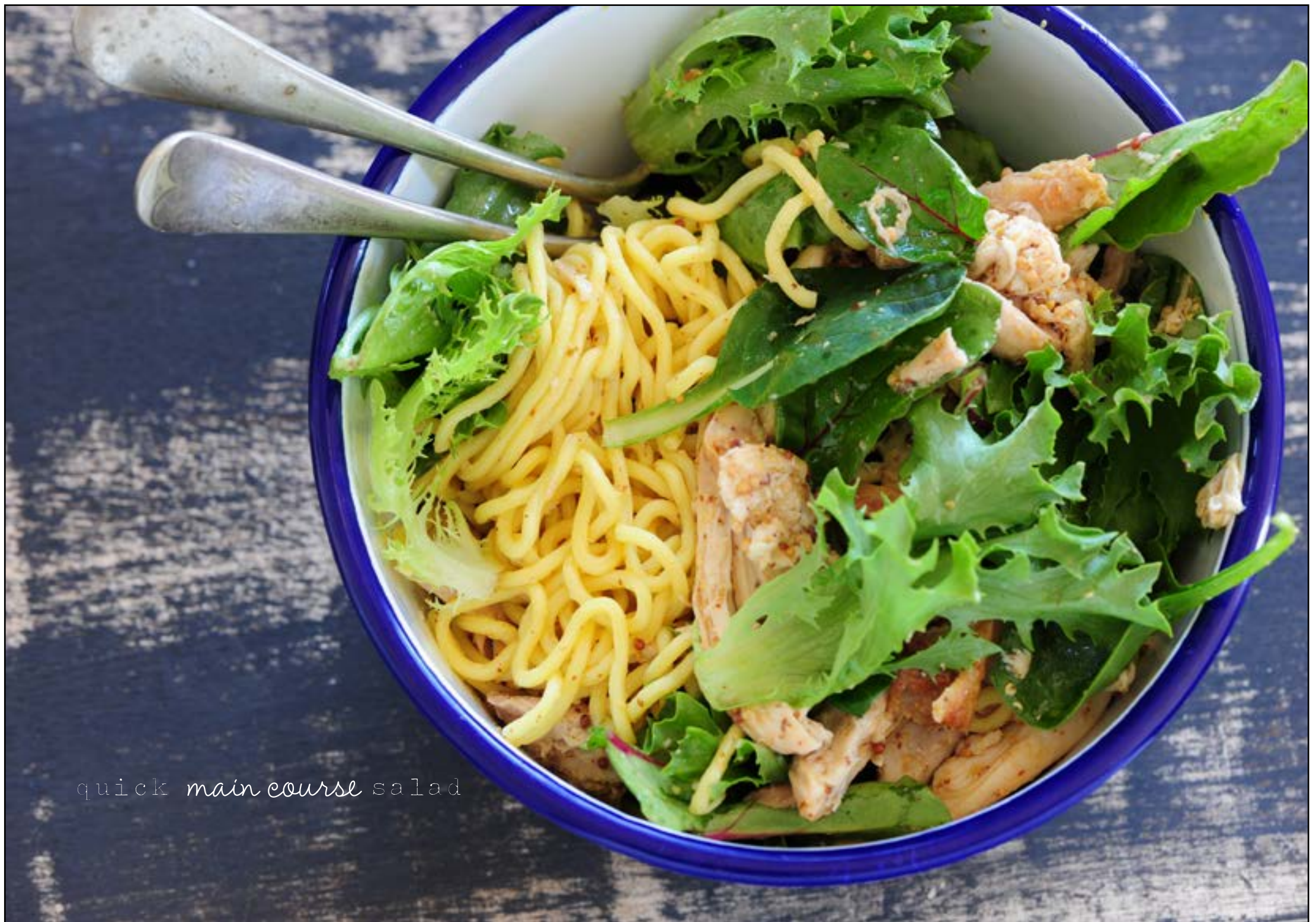
quick main course salad