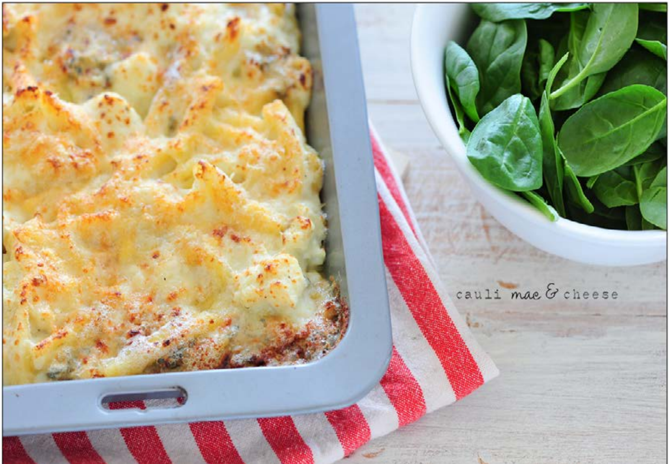
cauli mae & cheese