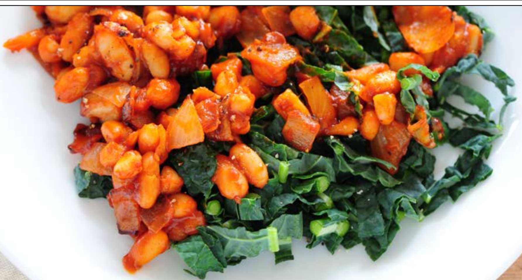
ketchup 'baked' legumes