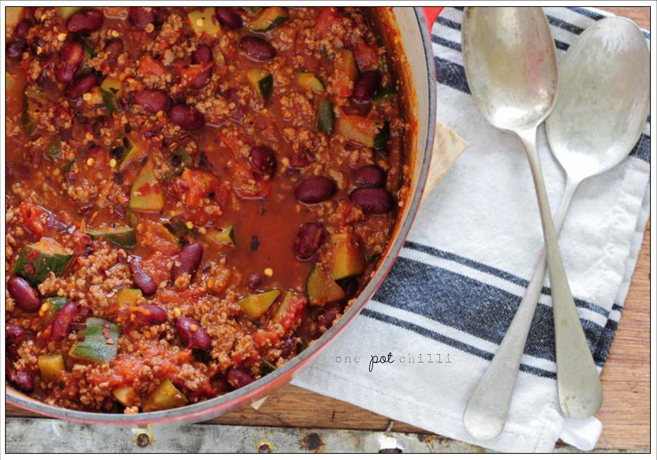
one pot chilli