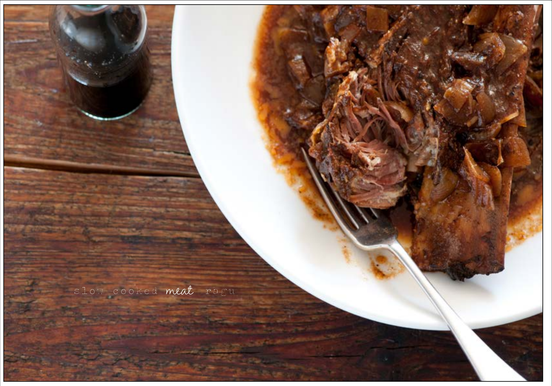
slow cooked meat ragu