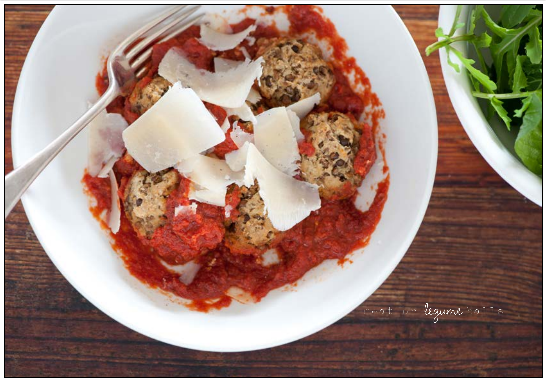
meat or legume balls