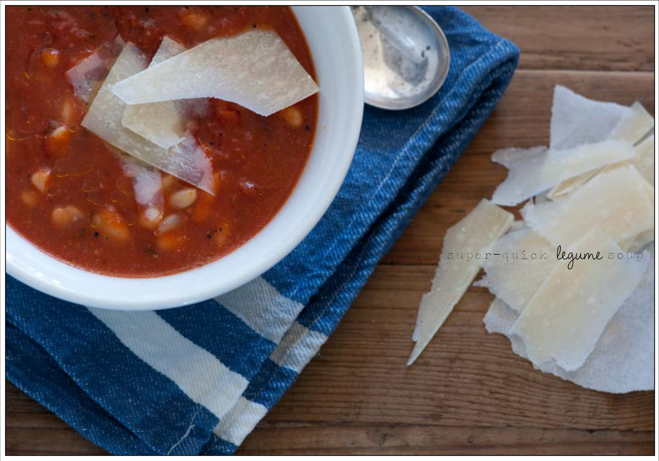
super-quick legume soup