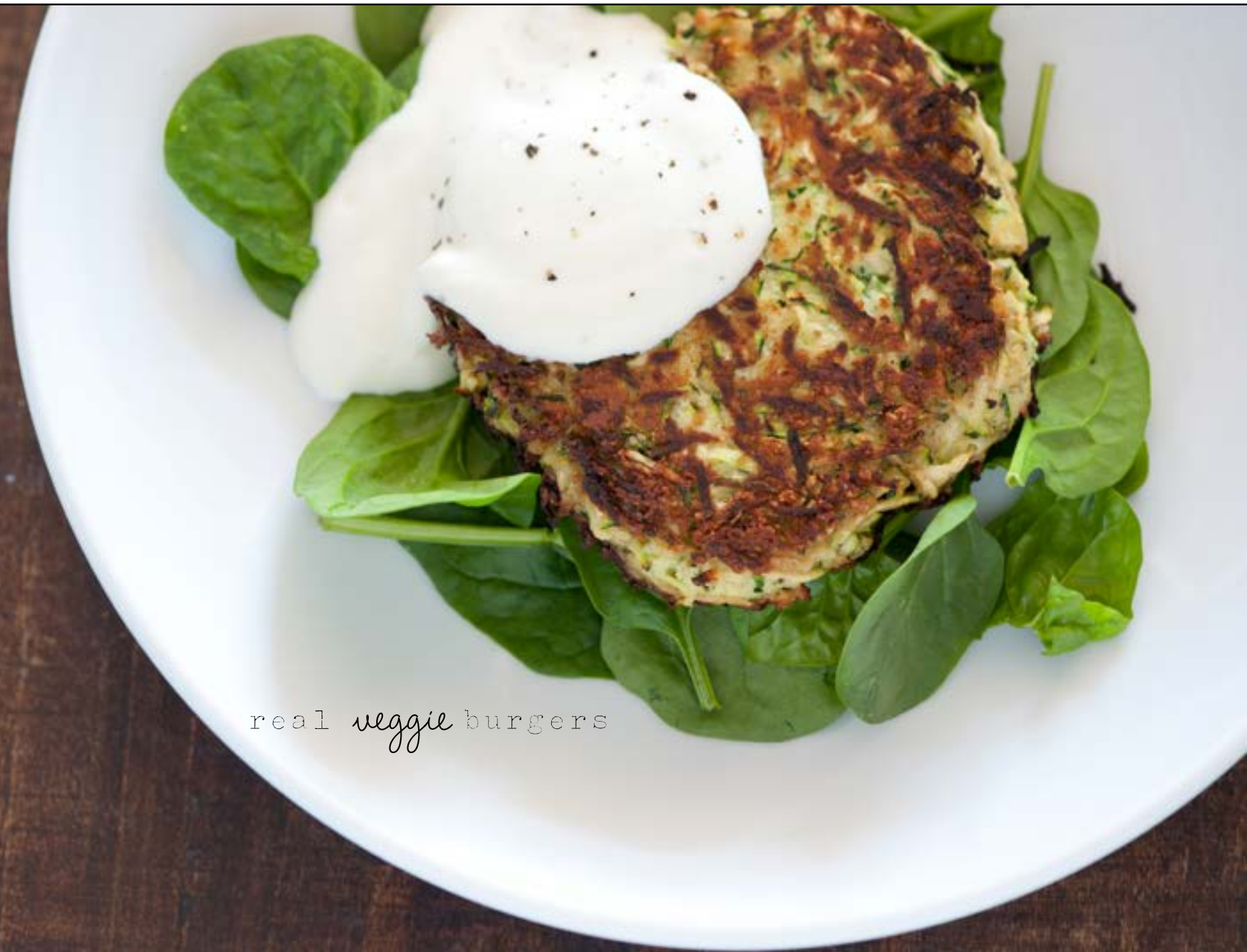
real veggie burgers