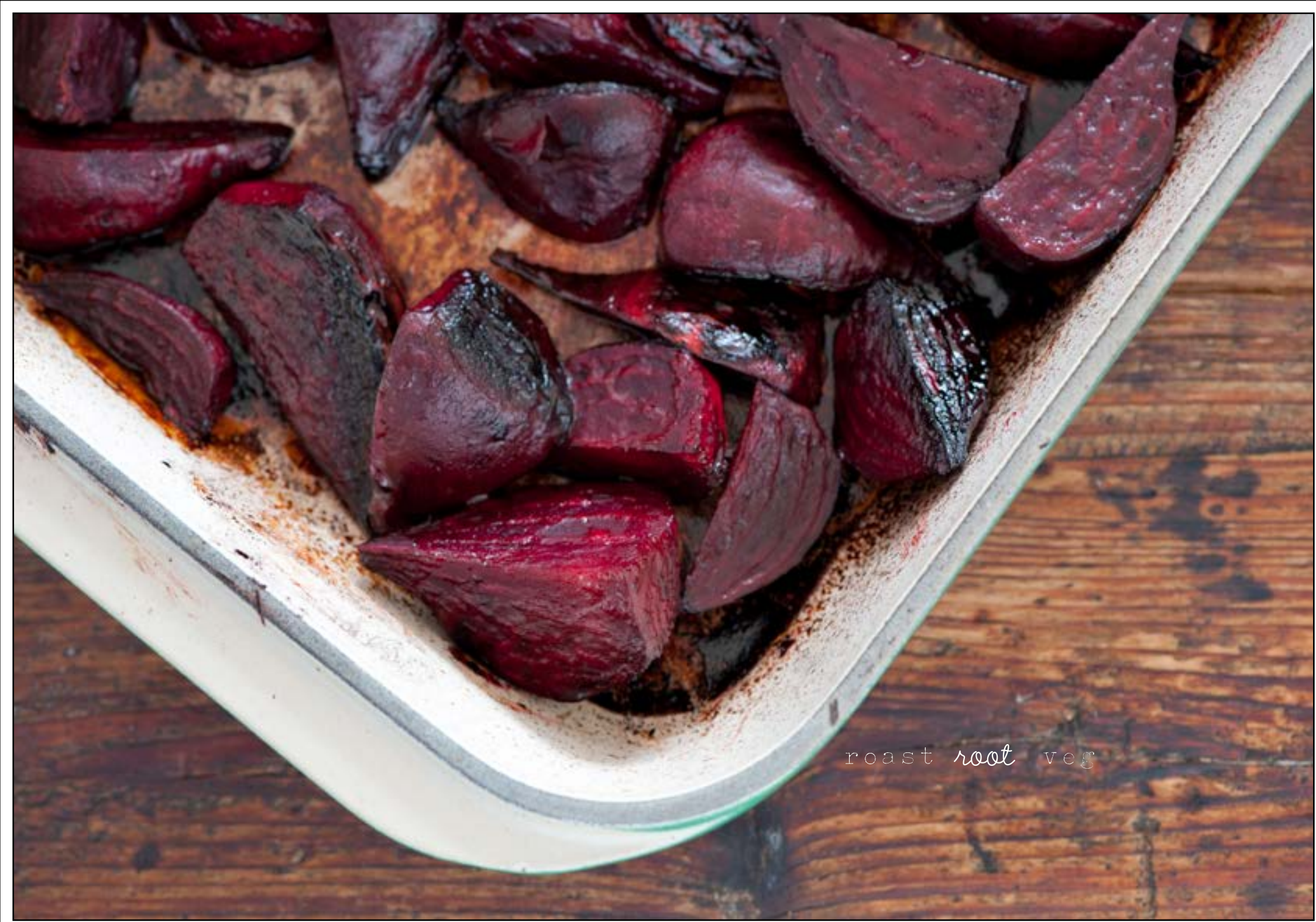
roast root veg