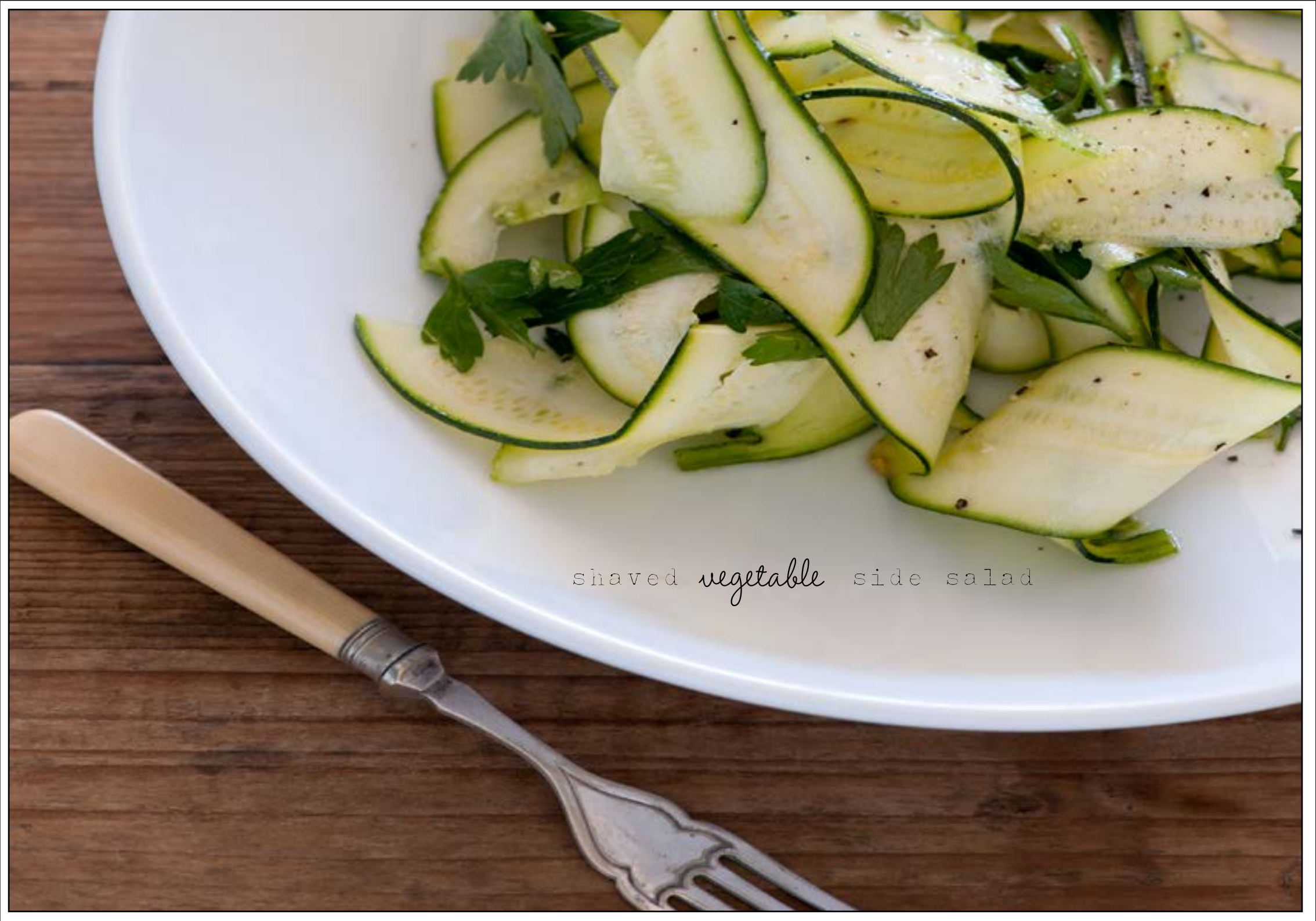
shaved vegetable side salad