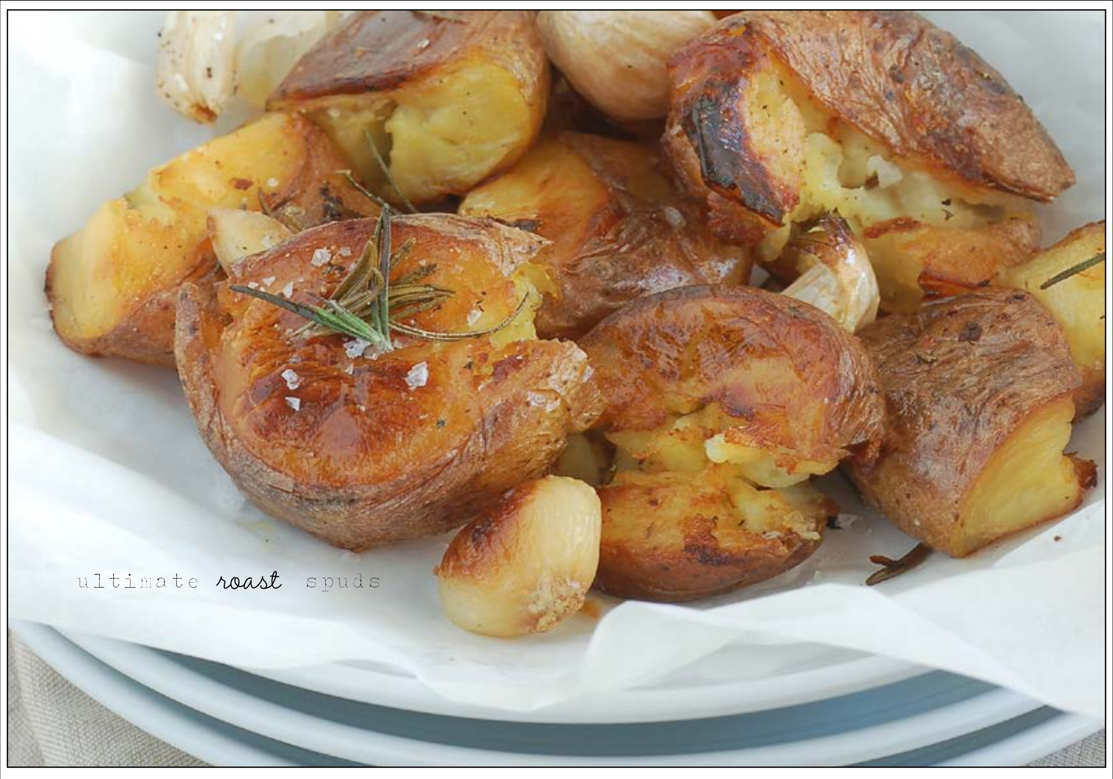
ultimate roast spuds