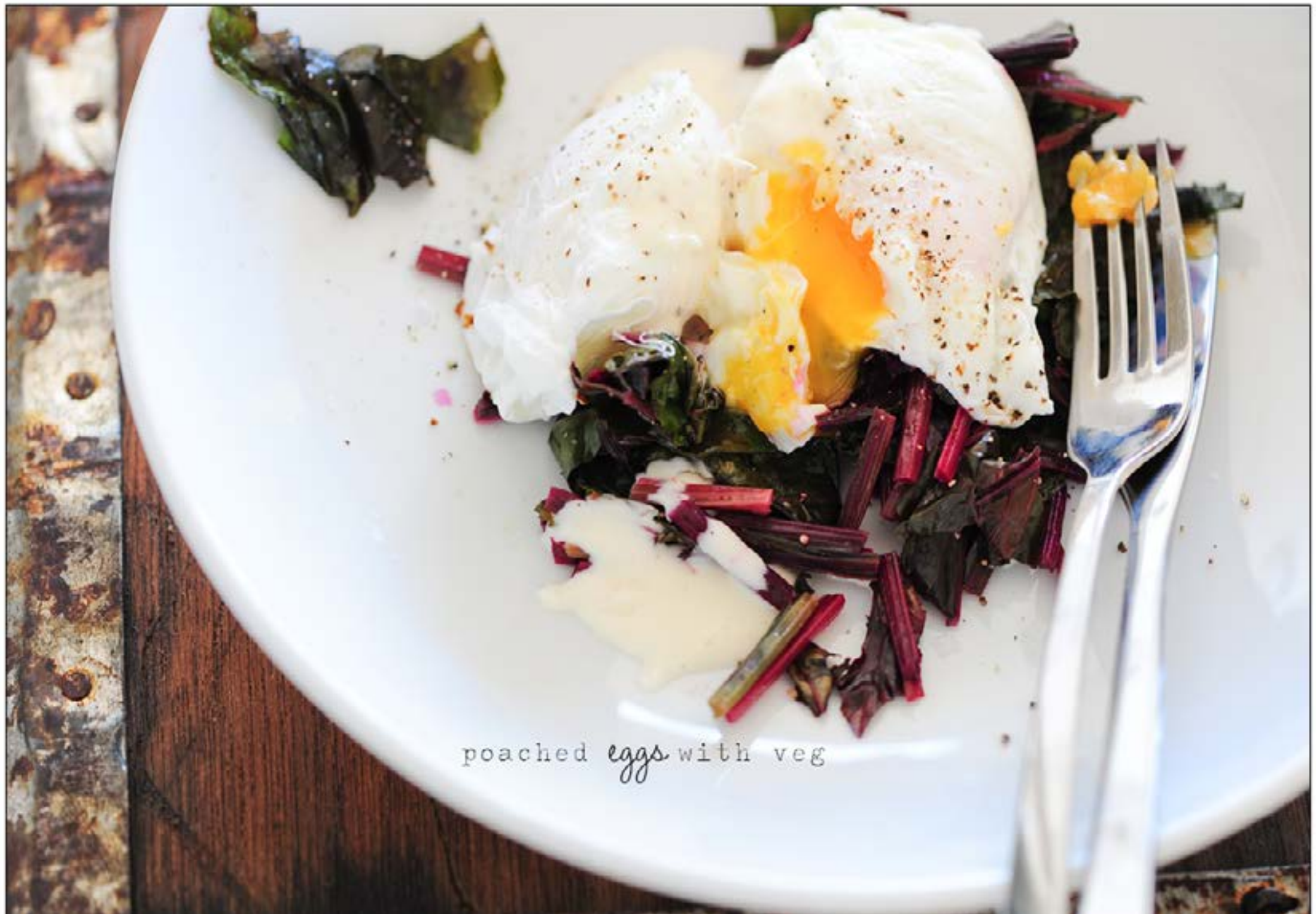
poached eggs with veg