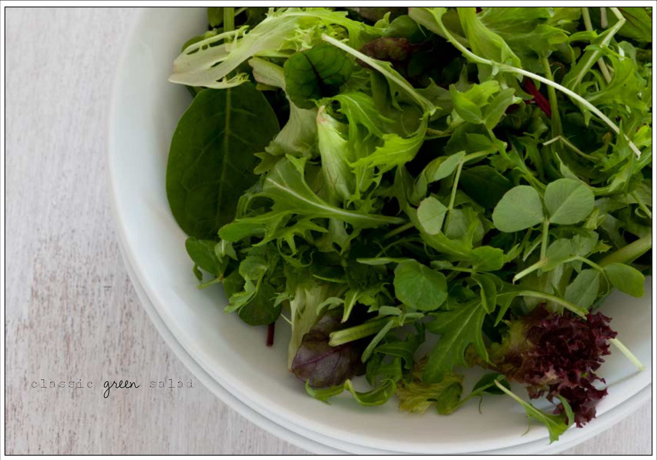
classic green salad