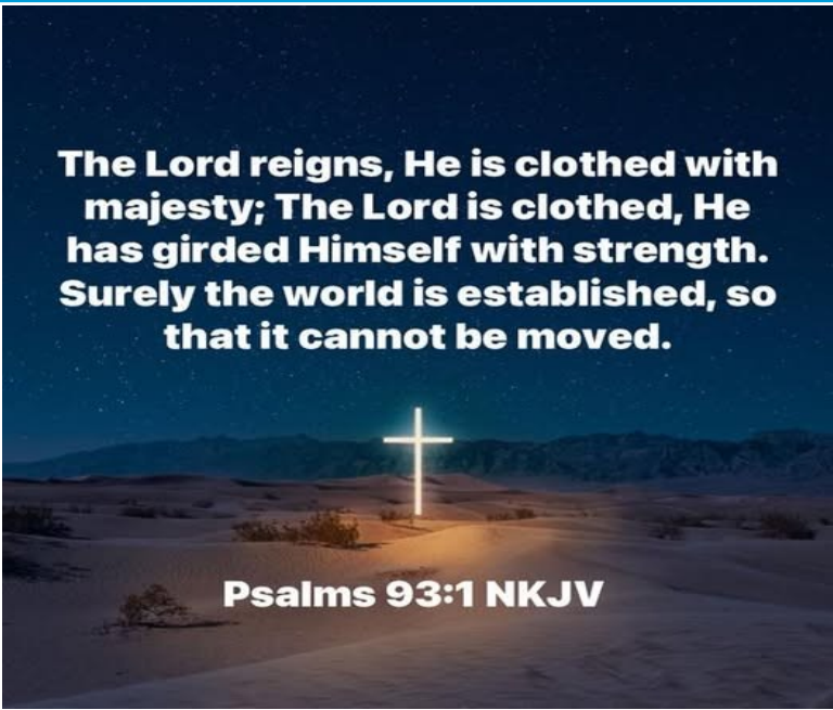
Psalms 93:1 NKJV

The Lord reigns, He is clothed with majesty; The Lord is clothed, He has girded Himself with strength. Surely the world is established, so that it cannot be moved.