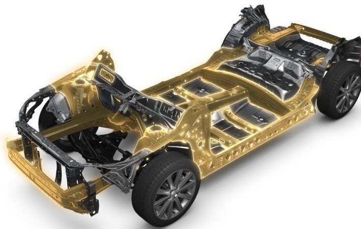
The Subaru Global Platform