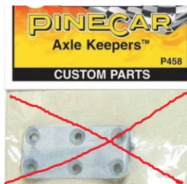
No axle guards/keepers

With the exception of decorative items, weights, glue, lubricants and finishing materials, only Official Pinewood Derby materials noted above may be used.