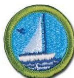
Small Boat Sailing