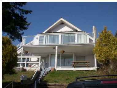
SOLD - PANORAMIC OCEAN VIEW $780,000