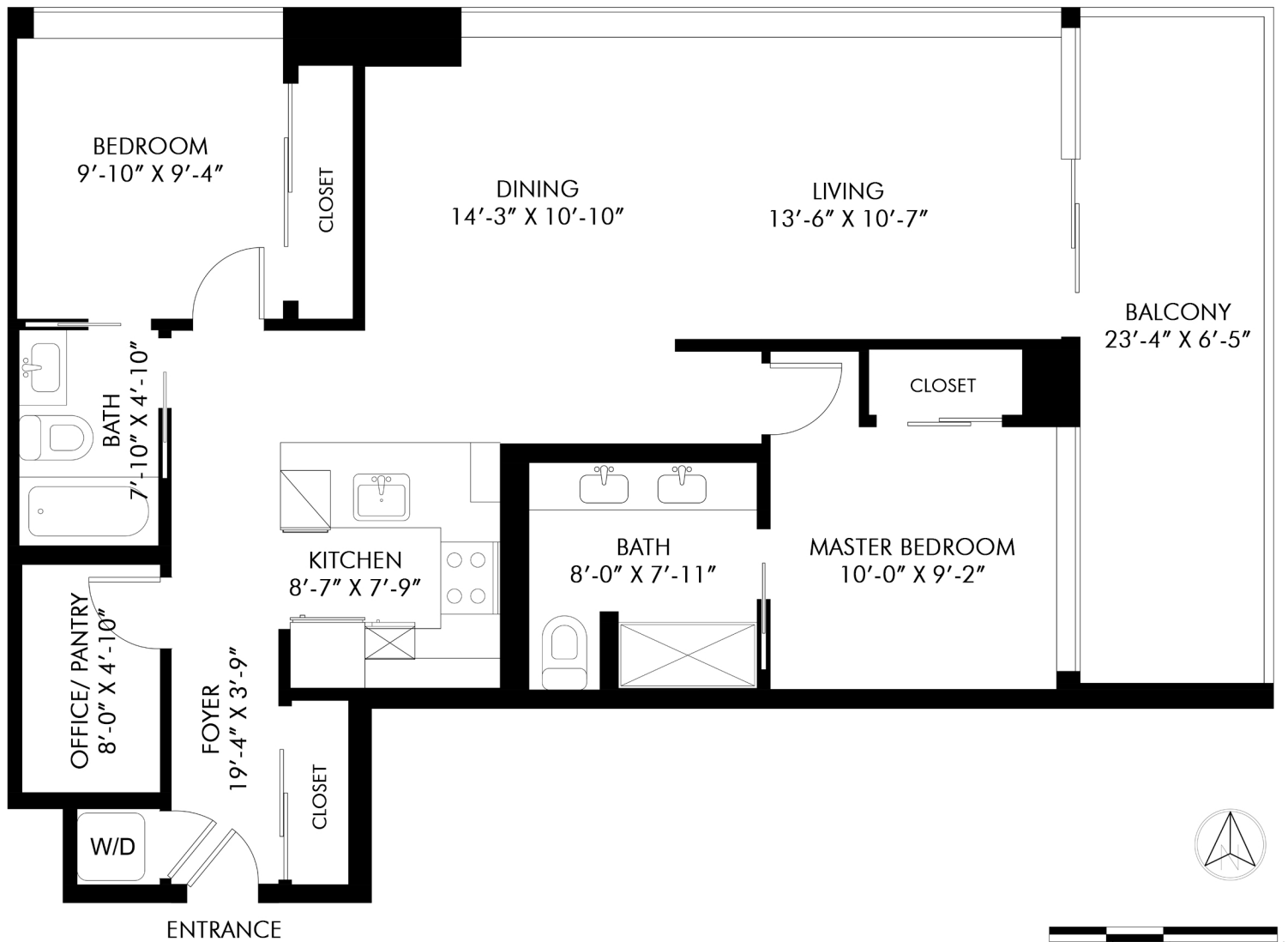
MAIN FLOOR PLAN Ceiling Height: 8'-4"

MAIN FLOOR TOTAL: 1,004 SQ. FT. BALCONY: 161 SQ. FT.