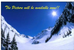
The Picture will be available soon!!

Status: Sold Built: 1980 Price: $529,900 Type: Chalet List Co: SWCR Size: 1,414 L. Size: Bath: 2.00 List Date: 01/27/2003 Bed: 3.0 MLS?: N Date Sold: 02/13/2003 Sld Price: $529,900 Includes Furniture?: N Includes GST?: N