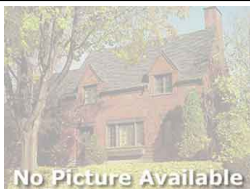
No Picture Available

Status: Sold Built: OT Price: $729,000 Type: Chalet List Co: RE/MAX Size: 1,395 L. Size: Bath: 2.00 List Date: 09/07/2004 MLS?: N Date Sold: 10/08/2004 Sld Price: $700,000 Includes Furniture?: Y Includes GST?: N