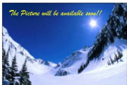
The Picture will be available soon!!

Status: Sold Built: 1987 Price: $695,000 Type: Duplex List Co: WREC Size: 1,617 L. Size: Bath: 2.00 List Date: 02/12/2004 MLS?: N Date Sold: 10/06/2004 Sld Price: $660,000 Includes Furniture?: N Includes GST?: Y