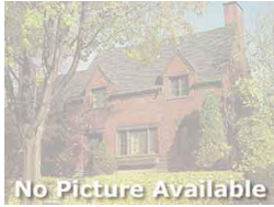
No Picture Available

Status: Sold Built: 2000 Price: $99,500 * Type: Shared Owner List Co: RE/MAX Size: 647 L. Size: Bed: 1.0 Bath: 1.00 List Date: 05/31/2007 MLS?: Y Date Sold: 09/23/2008 Sld Price: $93,750 Includes Furniture?: Y Includes GST?: N