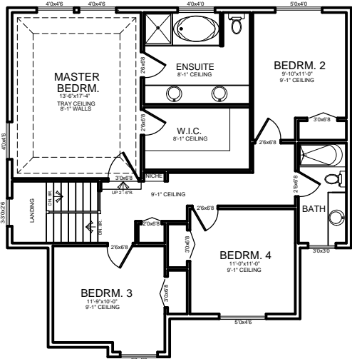
UPPER FLOOR = 1072 SQ. FT.