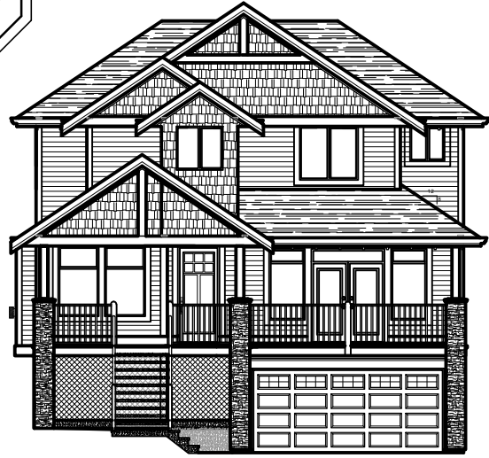
FINISHED AREA = 3201 SQ. FT.