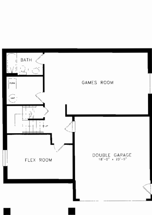
BASEMENT FLOOR PLAN: 880 SQ. FT. GARAGE: 385 SQ. FT. (SHOWING OPTIONAL FINISHED BASEMENT. WINDOWS & DOORS MAY VARY.)

Features may vary from home to home depending on floor plans & location. Builder reserves the right to modify plans, specifications, features & prices. Actual floor plans & square footage may vary slightly. Note: All sizes & dimensions are approximate, some minor changes may occur.