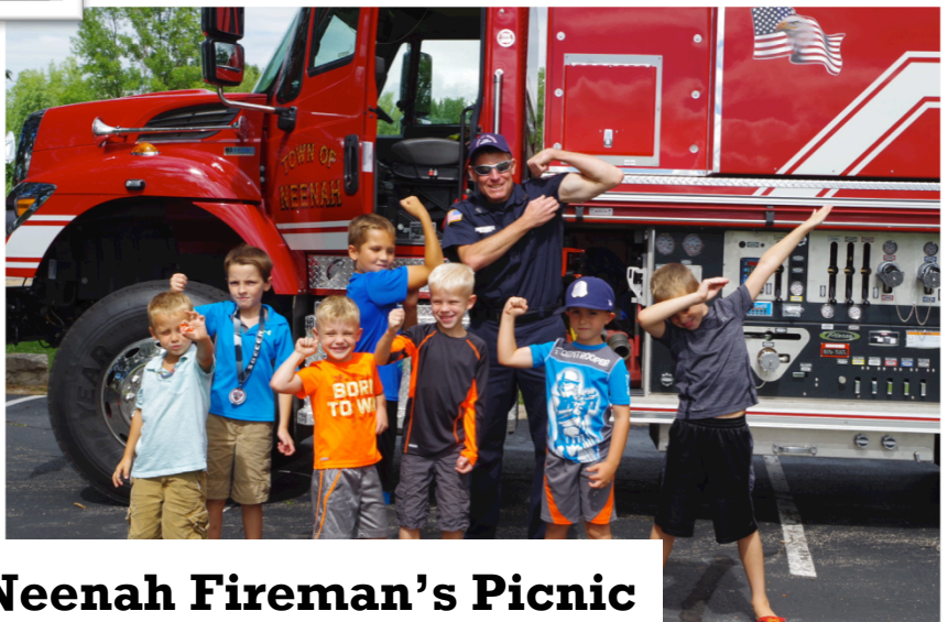
Town of Neenah Fireman's Picnic