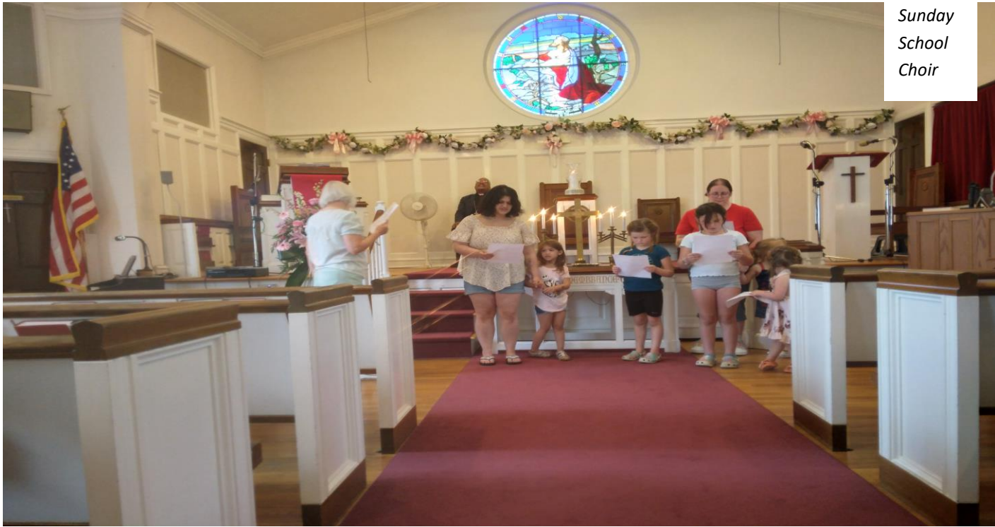
Sunday School Choir