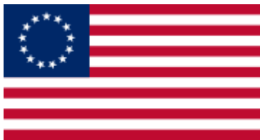
Original Flag 13 Stars

Do you know the flag's history? According to American legend, in June 1776, George Washington commissioned Betsy Ross, a Philadelphia seamstress, to create a flag for the new nation in anticipation of a declaration of its independence.