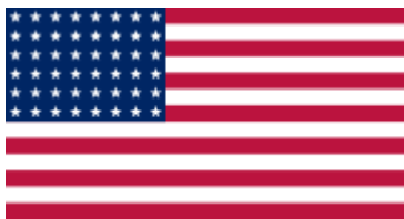
World War II 48 Star (what state was the last added Before Alaska and Hawaii?) Answer on the last page