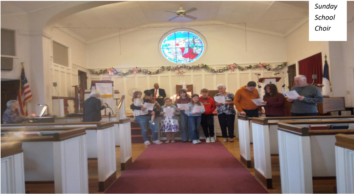
Sunday School Choir