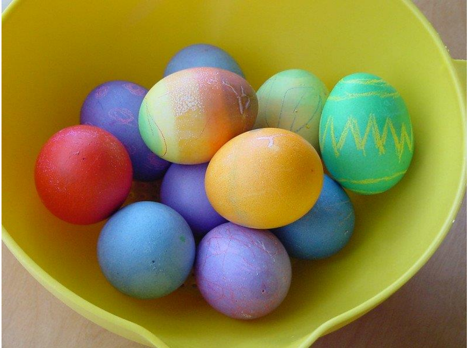
Rainbow eggs for Easter)

8. True or False: Easter Island is a real place in the World