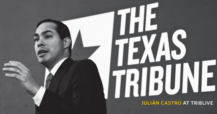
JULIÁN CASTRO AT TRIBLIVE

READERS PLAY ALONG AT A TEXAS TRIBUNE QRANK EVENT