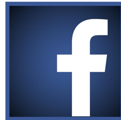
Facebook Facebook.com /Scrum.org