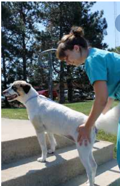
Elevated Hip Sways

With your dog on a leash, slowly go up and down 5-7 stairs 1-2 times/day. Increase the number of stairs/frequency each week. DO NOT GIVE YOUR DOG FREE ACCESS TO STAIRS YET. Always keep your dog on a leash while doing this exercise.