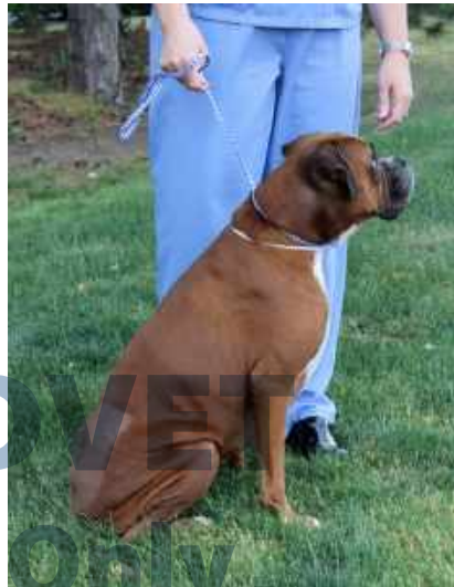
Proper sitting posture

This exercise encourages extension/flexion in rear leg joints and works the muscles. The object is to help your dog to sit down with good sitting posture and stand back up. Doing this exercise at feeding time or using a small treat to encourage may help.