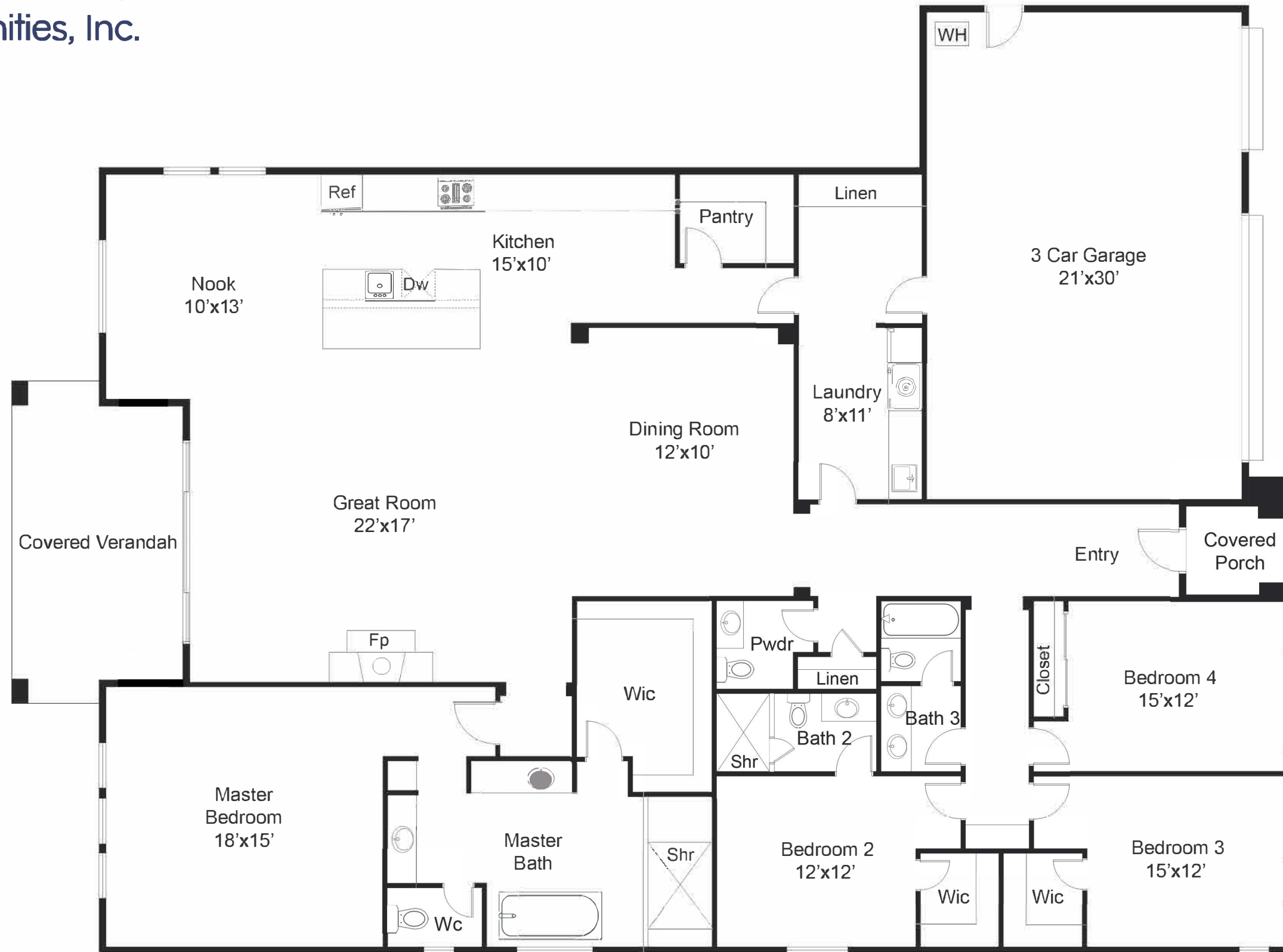
Robin Pointe Plan 2 4 Bed | 3 .5 Bath 3,170 SQ FT