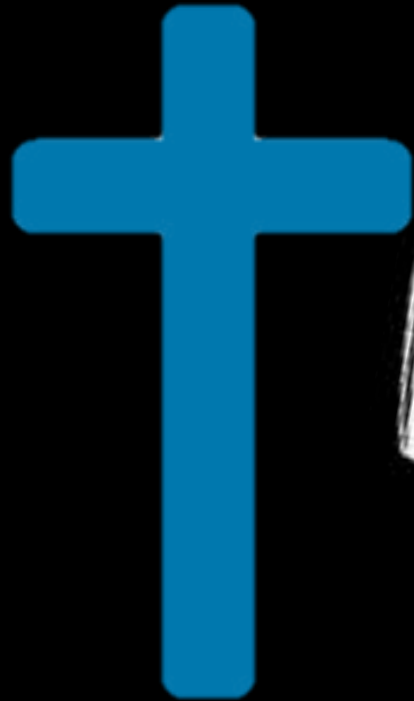
Christ, the Sinless Substitute