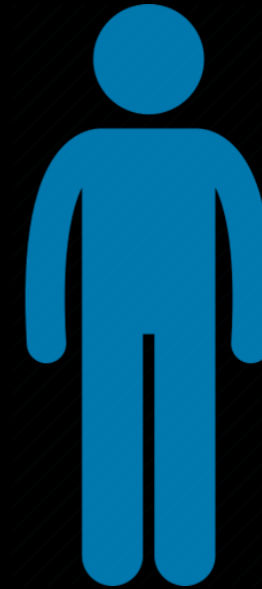
Man, the Guilty Sinner