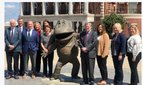
WKU Cupola Society Brunch - 2019