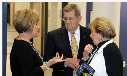
South Central Kentucky Community and Technical College