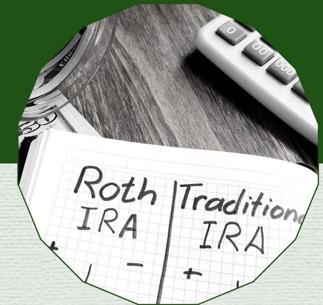
Roth IRA Conversions

We can run projections to see how potential changes (e.g., filing status, dependents, the sale of a business, stock option exercises, etc.) may impact your upcoming tax liability.