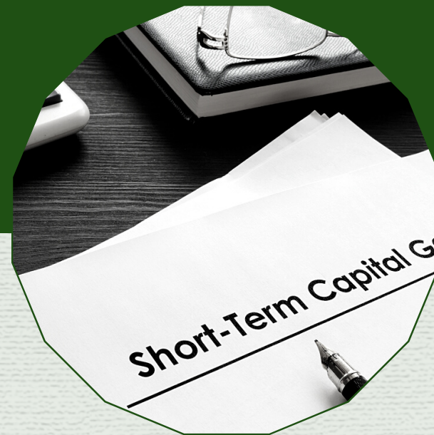
Realizing Capital Gains