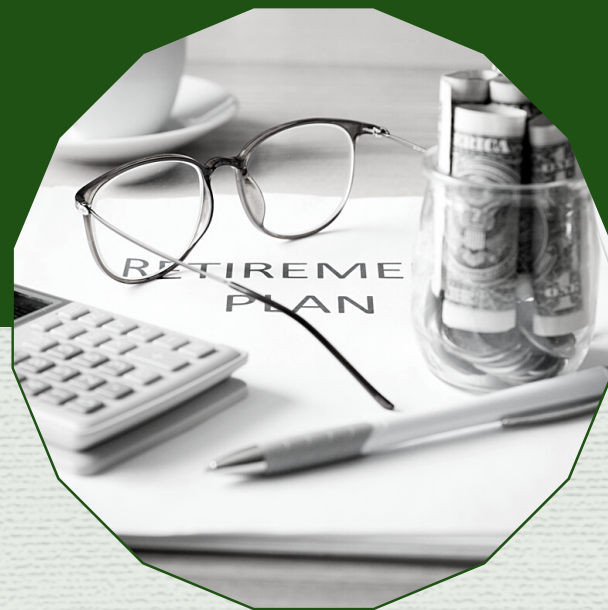
Tax Efficient Retirement Vehicles

We will evaluate a number of opportunities during tax planning, including topics like