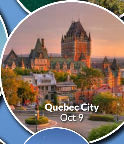
Quebec City Oct 9