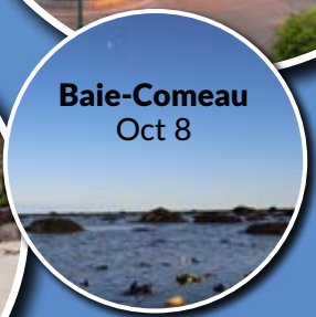
Baie-Comeau Oct 8