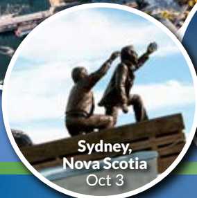
Sydney, Nova Scotia Oct 3