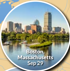
Boston, Massachusetts Sep 29