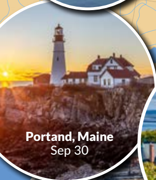
Portland, Maine Sep 30