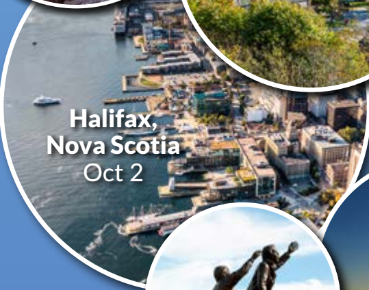
Halifax, Nova Scotia Oct 2