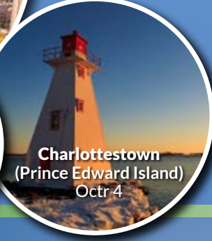
Charlottetown (Prince Edward Island) Oct 4