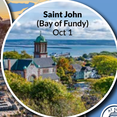
Saint John (Bay of Fundy) Oct 1