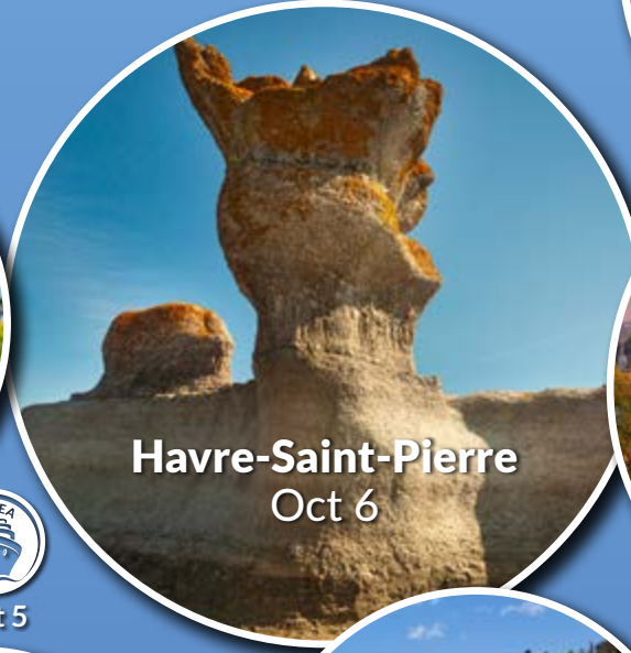
Havre-Saint-Pierre Oct 6