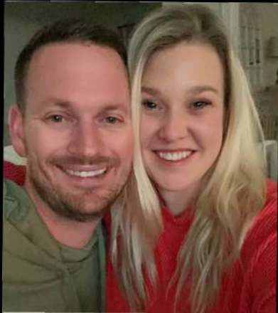
CELEBRATED 16 YEARS TOGETHER!!