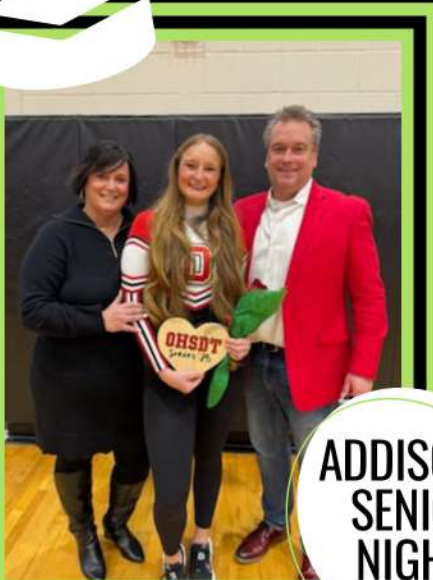
ADDISON'S SENIOR NIGHT!