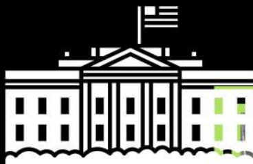
ADDISON VISITS WASHINGTON DC!