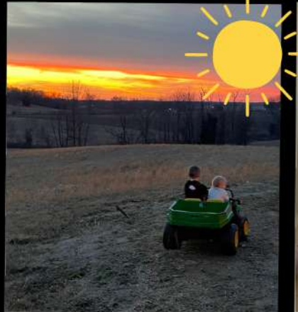
SUNSETS ON THE FARM