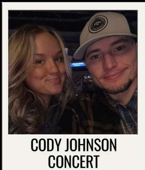
CODY JOHNSON CONCERT