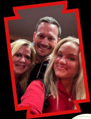
HALEY'S BIRTHDAY PARTY!