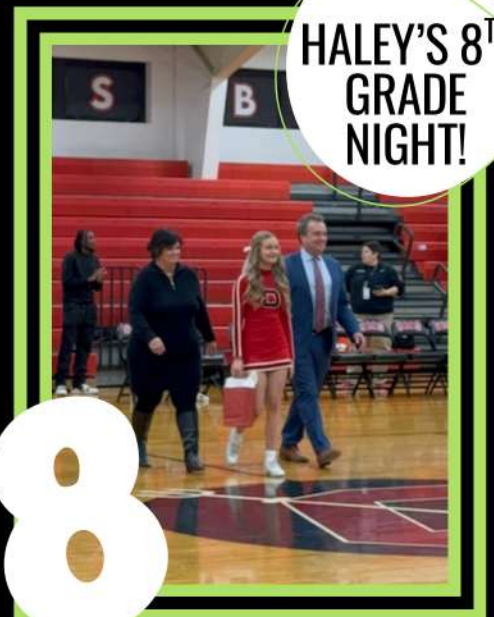
HALEY'S 8 TH GRADE NIGHT!