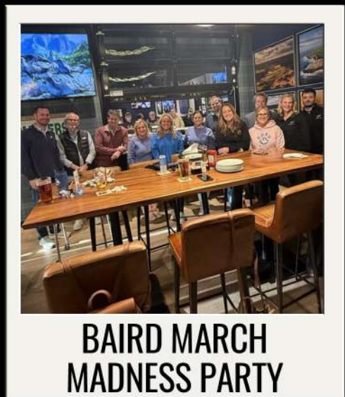
BAIRD MARCH MADNESS PARTY