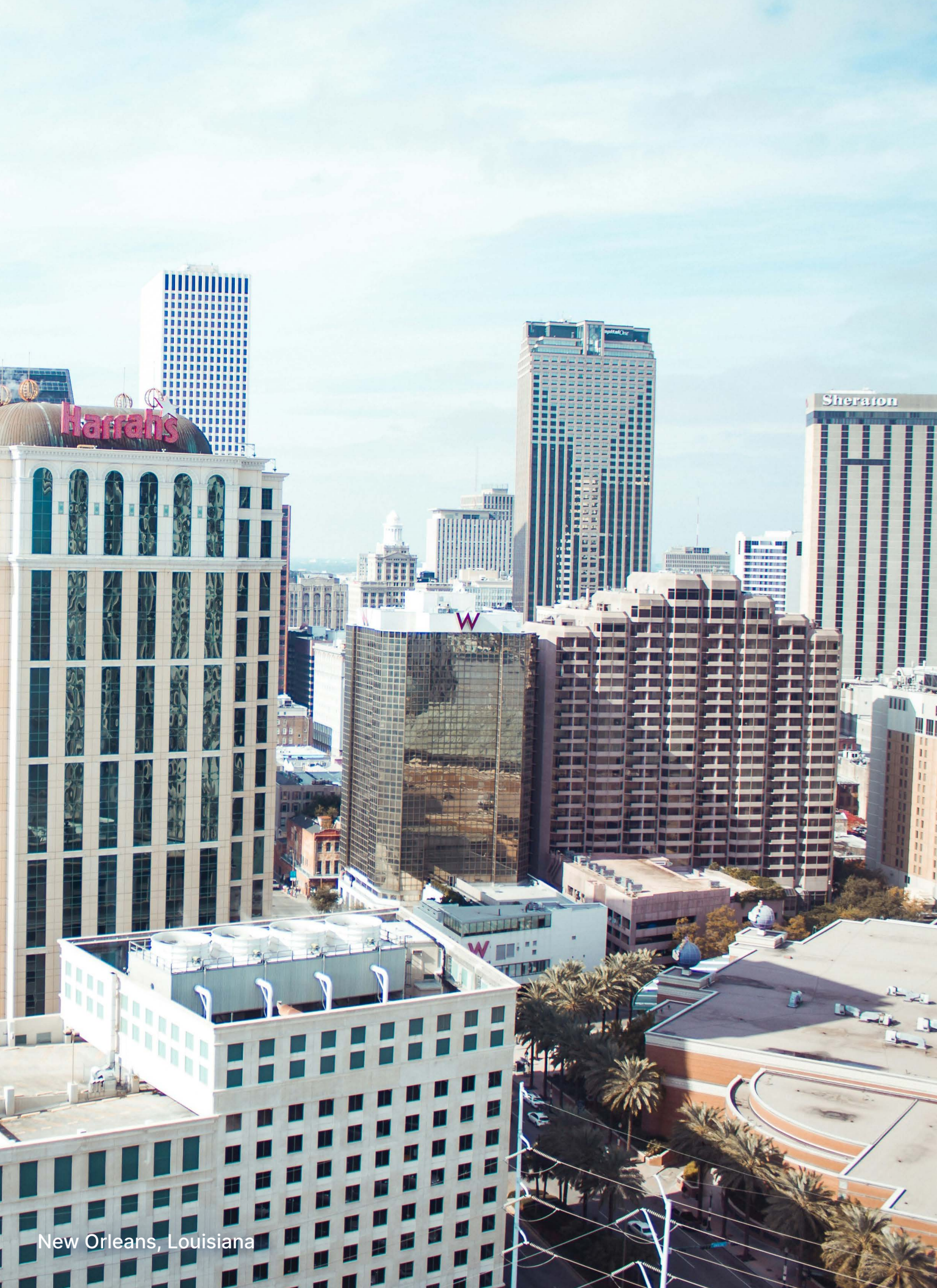
New Orleans, Louisiana