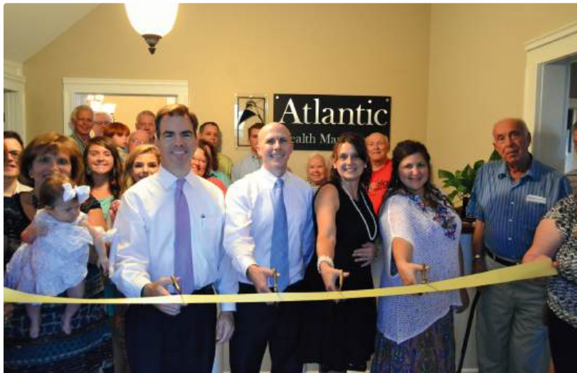
Atlantic Wealth Management Opening Day/Ribbon Cutting, August 2014

Thursday, August 22, 2024 5:30 - 7:30 p.m. Crystal Coast Civic Center