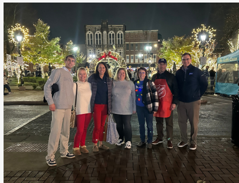
Our team on the square during Light Up Bowling Green Festival - Fountain Square