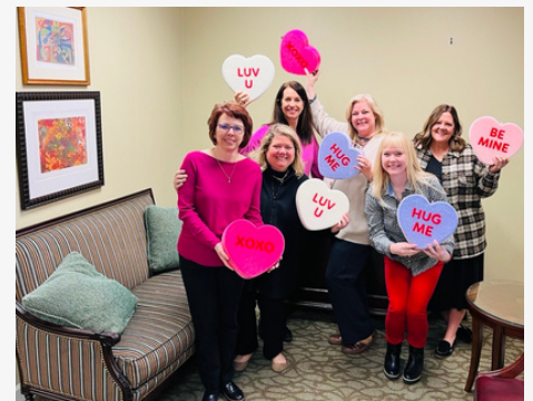
The girls celebrating Valentine's Day