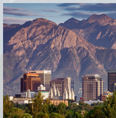
Salt Lake City (Rocky Mountain)