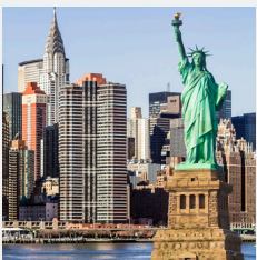
New York City (Mid-Atlantic)