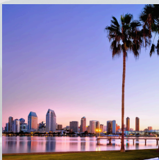
San Diego (Pacific)