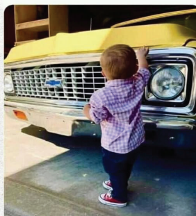
Teach your kids the love of Trucks and they will never have money for drugs.

Hopefully this inspires you to take a late summer trip and embark on a new adventure with the family. Stay hydrated!