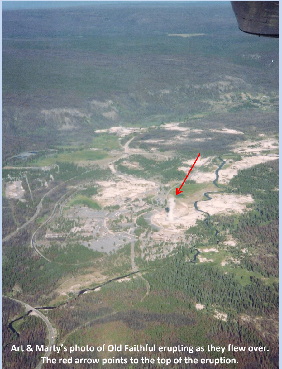
Art & Marty's photo of Old Faithful erupting as they flew over. The red arrow points to the top of the eruption.

Thanks Art and Marty for sharing your love for flying with us! We wish you both many years of safe travels!