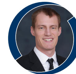
Timothy Brown Financial Services, Victor Office