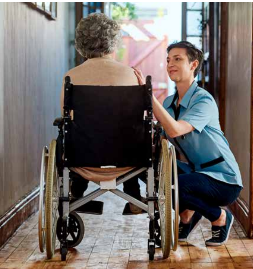
Gender of Caregivers

Research from Fidelity Investments suggests that women tend to invest in a slightly more conservative way than men. 14 Risk aversion — pursuing extremely conservative investments, or not investing at all and merely saving up