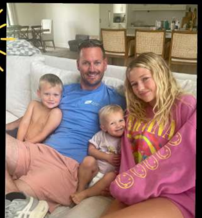
CELEBRATING FATHERS DAY!