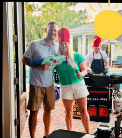
HABACHI FUN IN DESTIN!