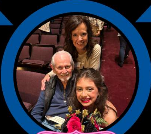
SCARLETT'S DANCE SHOWCASE