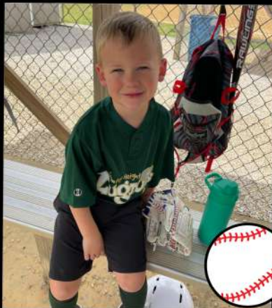
T-BALL SEASON STARTED!