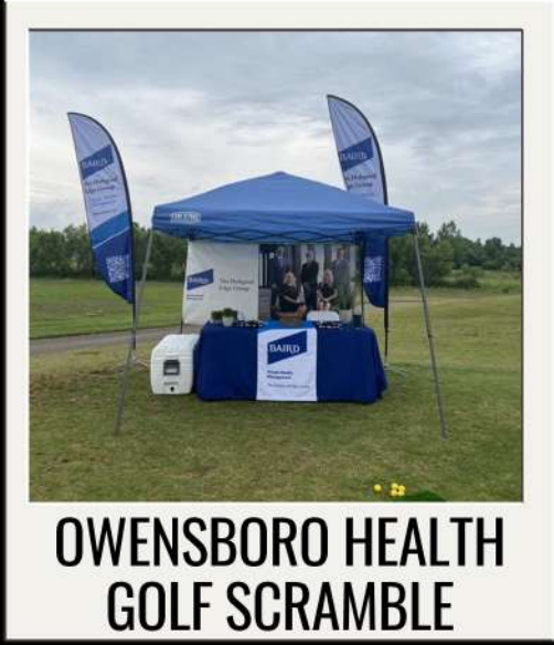
OWENSBORO HEALTH GOLF SCRAMBLE