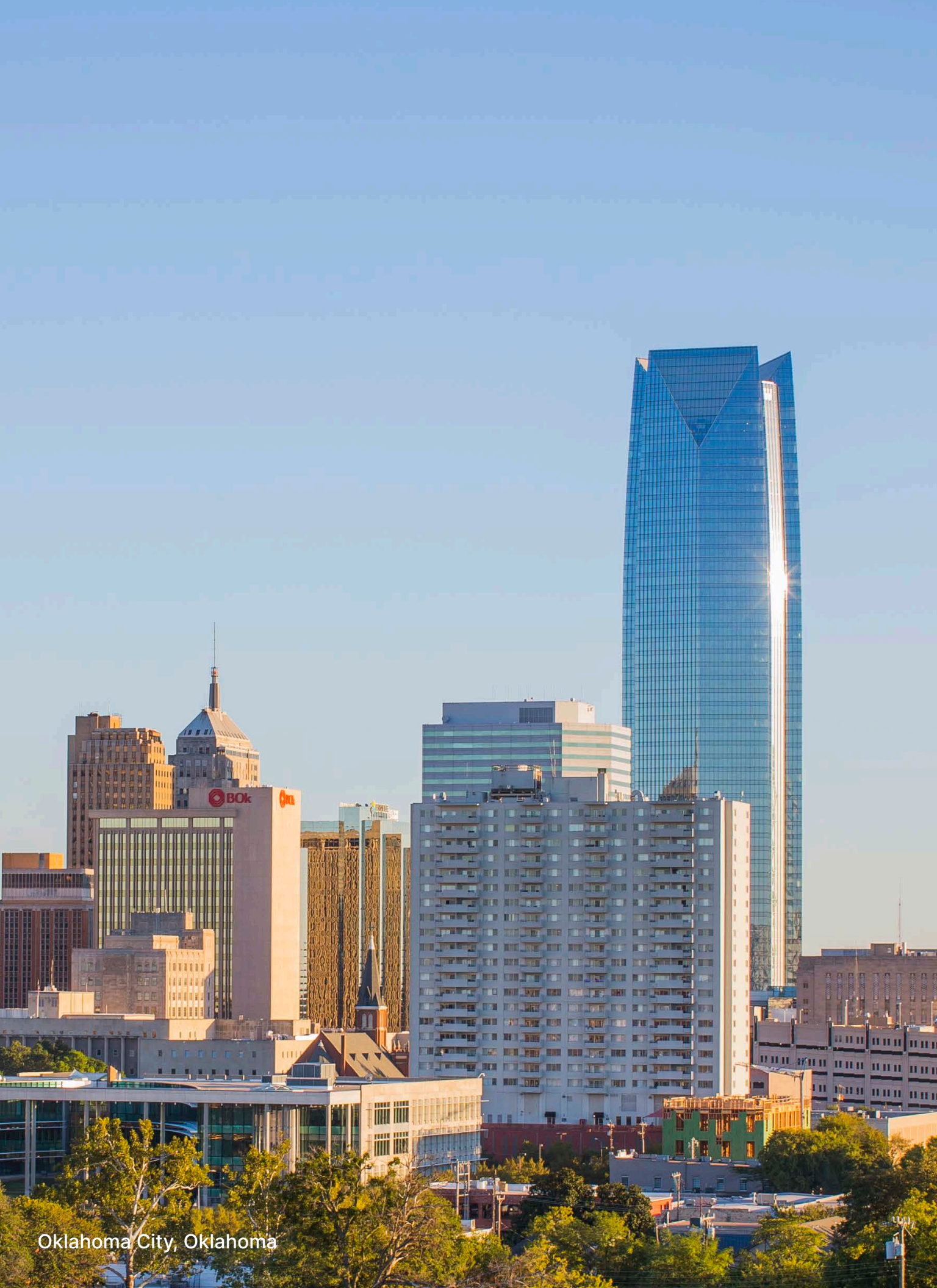
Oklahoma City, Oklahoma