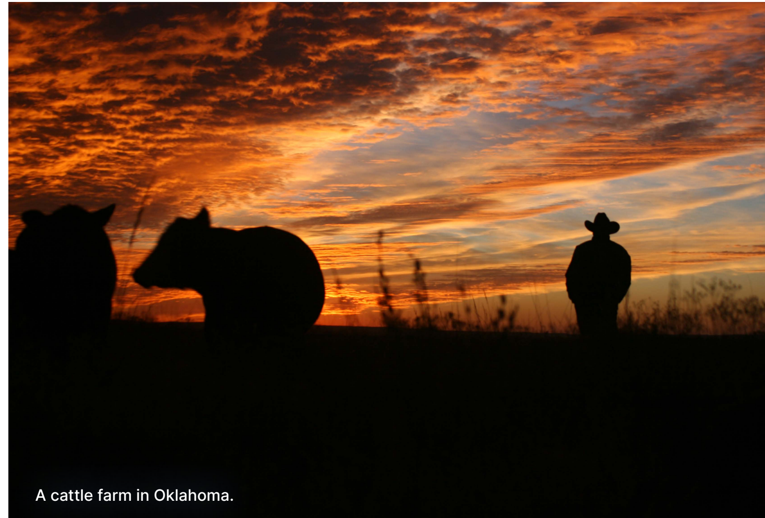
A cattle farm in Oklahoma.