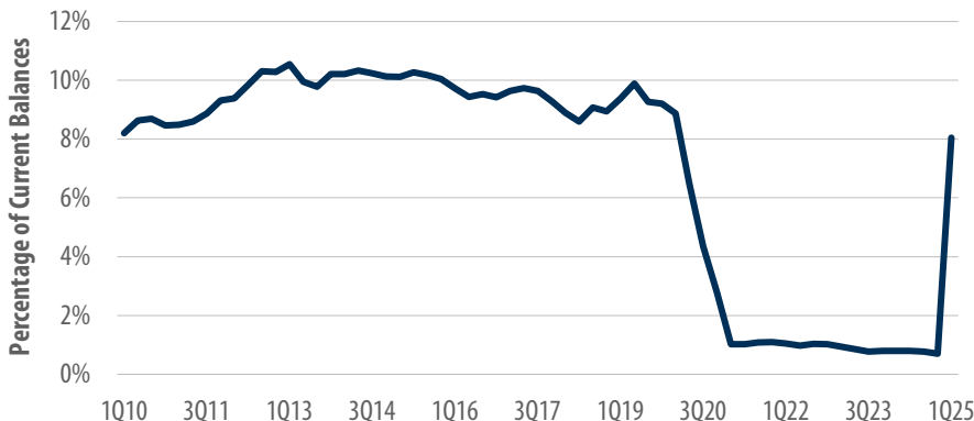
Sources: FRBNY Consumer Credit Panel, First Trust Advisors. Quarterly data Q1 2010- Q1 2025.

Seriously delinquent defined as >90 days.