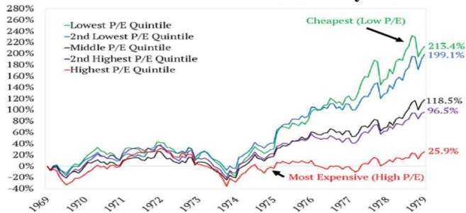
Exhibit 3: US Stock Market Performance by P/E Ratio

Data from December 31, 1969 through December 31, 1979, File #0177.