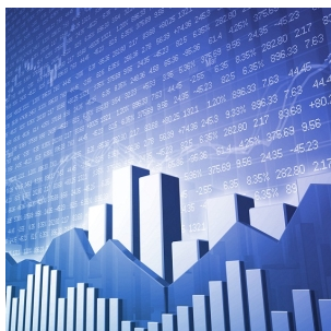
Chart reflects price changes, not total return. Because it does not include dividends or splits, it should not be used to benchmark performance of specific investments.