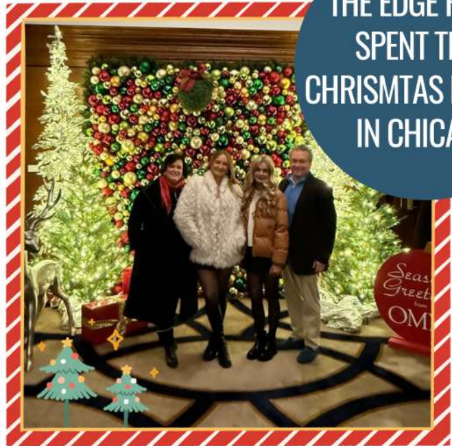
THE EDGE FAMILY SPENT THEIR CHRISTMAS HOLIDAY IN CHICAGO!