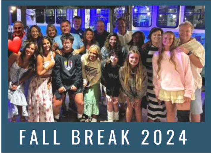
FALL BREAK 2024