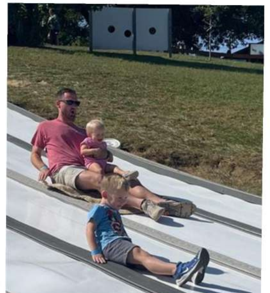
FUN DOWN THE SLIDE!!!