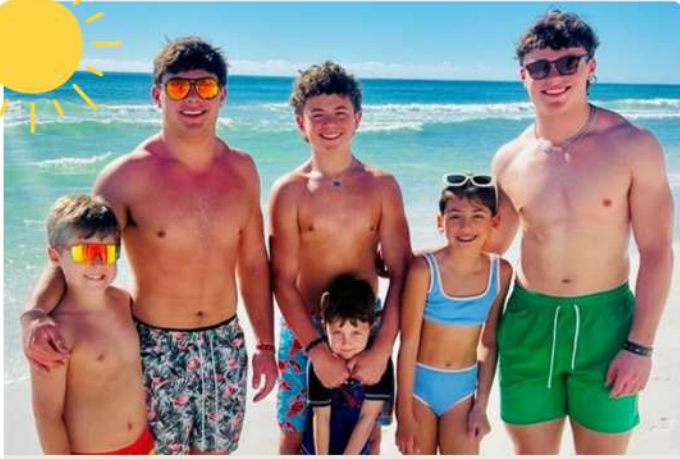
WINTER BREAK BEACH VACATION 2024