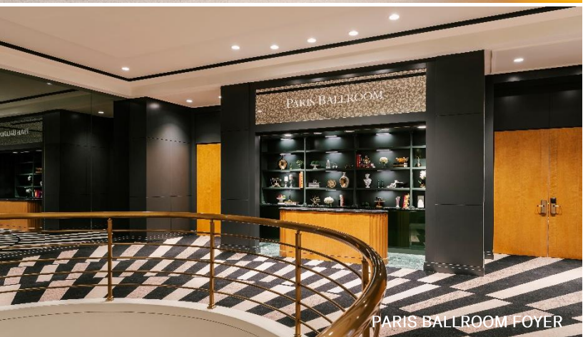
PARIS BALLROOM FOYER