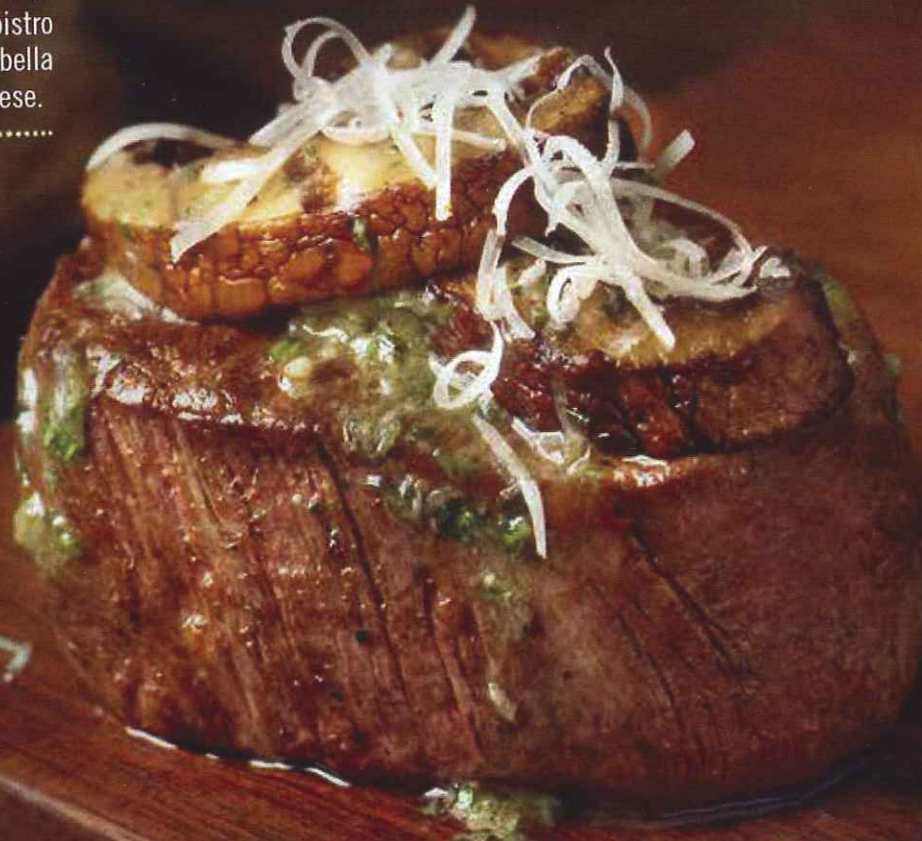
VICTORIA'S FILET® MIGNON PORTABELLA