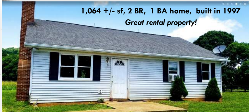
1,064 +/- sf, 2 BR, 1 BA home, built in 1997 Great rental property!