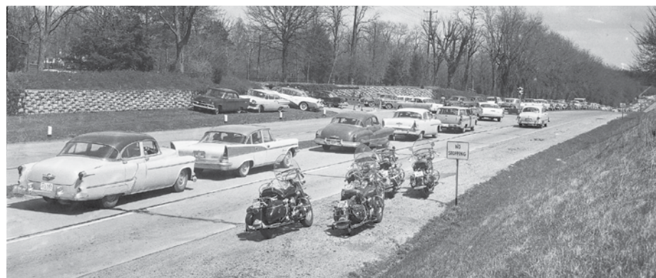
Cars lined up on Versailles Road outside the main entrance to Keeneland on April 12, 1958.

Sept. 23: Keeneland conducts an orientation about Thoroughbred racing for 13 governors attending the Southern Governor's Conference in Lexington.