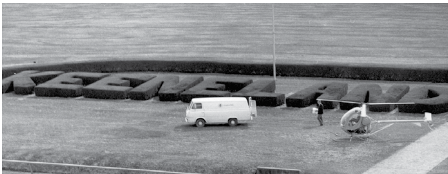
At one time programs were delivered to Keeneland by helicopter to ensure timely arrival.

Oct. 19: Racing Hall of Famer Bowl of Flowers wins the Spinster.