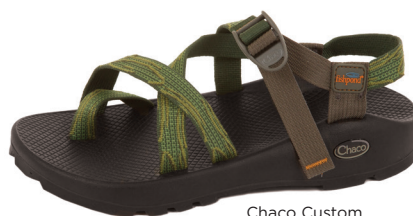
Chaco Custom Webbing Sandals

Chaco also formed a new sponsorship agreement with renowned guide service O.A.R.S. Chaco is now the official footwear sponsor of O.A.R.S and its over 300 guides and river staff working rivers from