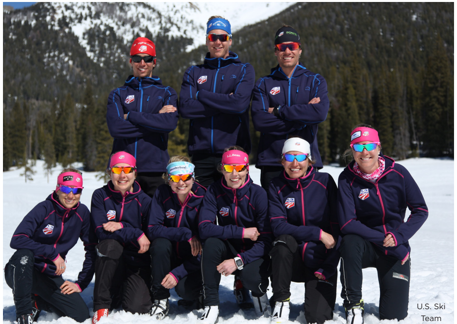
U.S. Ski Team