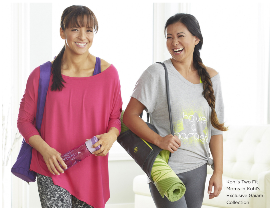
Kohl's Two Fit Moms in Kohl's Exclusive Gaiam Collection