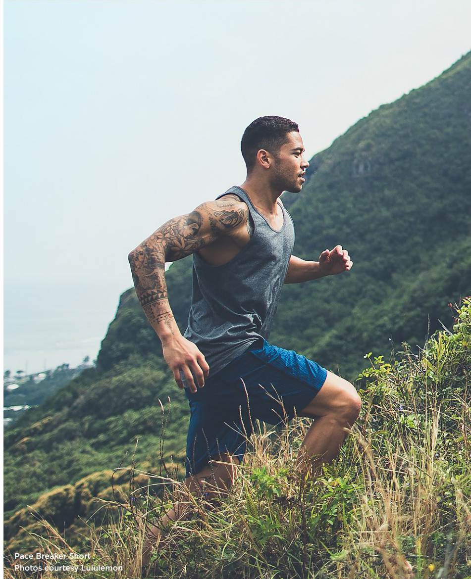
Pace Breaker Short

The Tight Stuff Half Tight, $88, and Tight Stuff Tight, $98, feature sweat-wicking, four-way stretch, full-on Luxtreme fabric, flat-seam construction to minimize chafing, and details such as a drawcord waistband and pockets. The