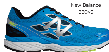
New Balance 880v5