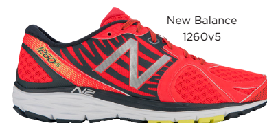
New Balance 1260v5