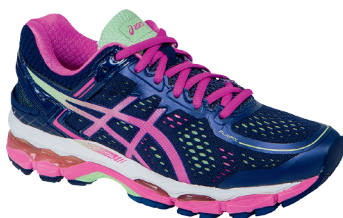
Asics Gel-Kayano 22

The GT-1000 4, $100, is updated with a new upper built with engineered mesh yet supportive overlay reinforcements. The bouncy SpE-VA midsole has been engineered to provide a smooth, cushioned ride, while the DuoMax System and Guidance Trusstic System supports mild and moderate overpronators. Said Kerley, "If you're an overpronator with $100 to spend, there's literally nothing else on the market."