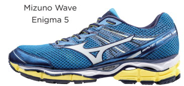
Mizuno Wave Enigma 5