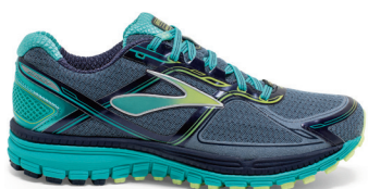
Brooks Ghost 8