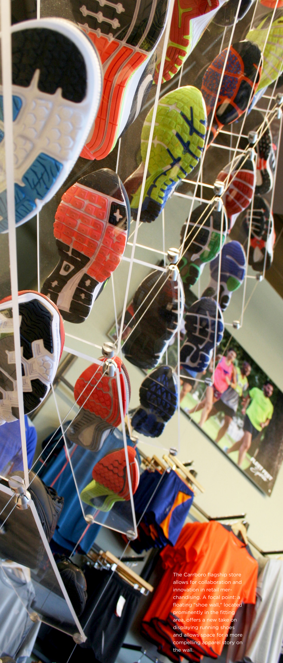
The Carrboro flagship store allows for collaboration and innovation in retail merchandising. A focal point: a floating "shoe wall," located prominently in the fitting area, offers a new take on displaying running shoes and allows space for a more compelling apparel story on the wall.