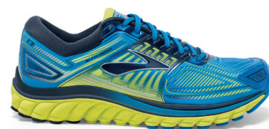
Brooks Glycerin 13