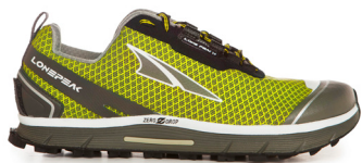
Altra Lone Peak Neoshell