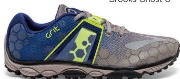
Brooks PureGrit 4

also features the full-length segmented crash pad.