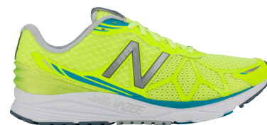
New Balance Vazee Pace

Part of the New Balance running line-up, the 1260v5 stability shoe, $150, adds N2 Burst technology in the forefoot, which is designed specifically for the moderate overpronator and configured with the intention to balance protection and flexibility when following through.