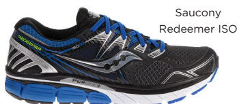
Saucony Redeemer ISO