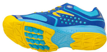
Newton Running Boco AT