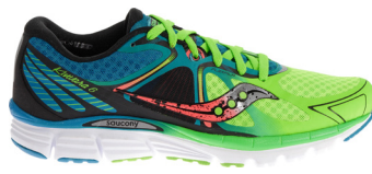
Saucony Kinvara 6