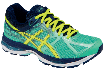
Asics Gel-Cumulus 17