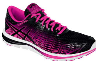
Asics Gel-Super J33 2

The Gel-Super J33 2, $100, adds FluidAxis, dialed to the specific needs and foot geometry of mild to moderate overpronators looking for an ultra-lightweight ride.