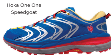
Hoka One One Speedgoat

On the MTN Run side, the Speedgoat, $130, was designed with input from legendary ultrarunner Karl Meltzer and built for the most technical trails. It features a Vibram rubber outsole with four-millimeter lugs and trail-specific flex grooves.