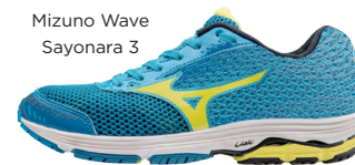
Mizuno Wave Sayonara 3

The Wave Sayonara 3, $110, sees its midsole profile modified to 10-20mm (from 9-19mm) to enhance the underfoot feel. The midfoot has also been sculpted to offer more of a pure neutral ride. Blown Rubber has replaced G3 in the forefoot and X10 has been added to the midfoot lateral side for greater durability for midfoot runners. The upper features soft internal straps to hold and support the foot.