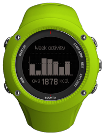
Suunto Ambit3 Sport GPS watch

The Suunto Connected Family with Ambit3 that launched in September 2014 is expanding with the launch of the Suunto Ambit3 Run GPS watch – as well as bringing new colors for the Ambit3 Sport and the Smart Sensor belt. All Ambit3 watches will receive updates this spring with additional functionality surrounding workout planning and recovery analysis.