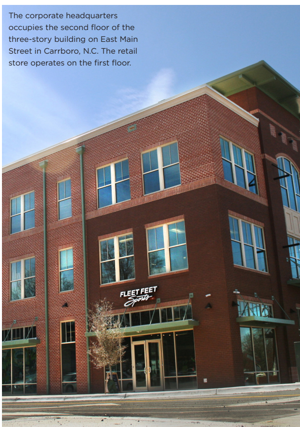
The corporate headquarters occupies the second floor of the three-story building on East Main Street in Carrboro, N.C. The retail store operates on the first floor.

“This occasion is just a dream come true for Fleet Feet Sports, and one that really is a testament to what our passionate group of franchise owners, our staff, and our partners have been able to do for this brand.”