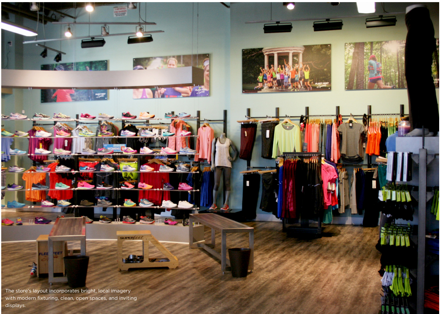
The store's layout incorporates bright, local imagery with modern fixturing, clean, open spaces, and inviting displays.