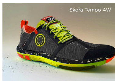
Skora Tempo AW

Georgia Shaw, director of marketing, Topo, said, “Once brands stop chasing ‘extremes,’ such as minimalism and maximalism, the differentiating features will lie in fit, weight, and ride, which will have to be addressed through materials, compounds, and revised last shapes. There isn’t one product direction that works for everyone, we all have different needs, tastes, and workout routines that necessitate different product requirements.”