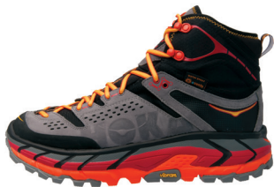
Hoka One One Tor Ultra Hi WP

The brand is also releasing updates to some of its most popular styles for fall, including the Clifton 2, Stinson 3 and Stinson 3 ATR. The Clifton 2 improves upon the award-winning original by introducing a padded tongue for increased comfort and additional structural overlays to improve midfoot support; while the Stinson 3 and Stinson 3 ATR now feature a more balanced Meta-Rocker for improved forefoot support, along with light padding on the tongue for increased comfort.