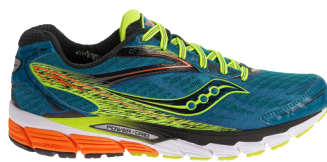
Saucony Ride 8

The Kinvara 6, $100, sports new open and breathable mesh and a re-engineered Pro-Lock lacing system for an enhanced midfoot fit. It keeps a 4mm offset and PowerGrid cushioning in the heel. Said O'Malley, "While people have moved away from minimalist models, the Kinvara has stayed on the wall and the reason is because it allows the foot to work naturally but it still gives you all the protection you need."