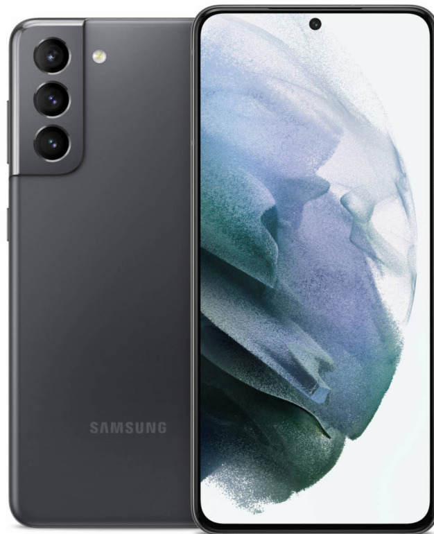
SAMSUNG Galaxy S21 5G

With 24 monthly bill credits when you trade in a qualifying device. If you cancel wireless service, credits may stop & remaining balance on required finance agreement may be due. For well-qualified customers; plus tax.