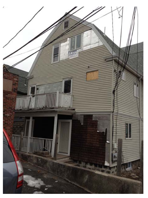
86 Powderhouse Blvd: (t) existing porch, (b) view from the sidewalk