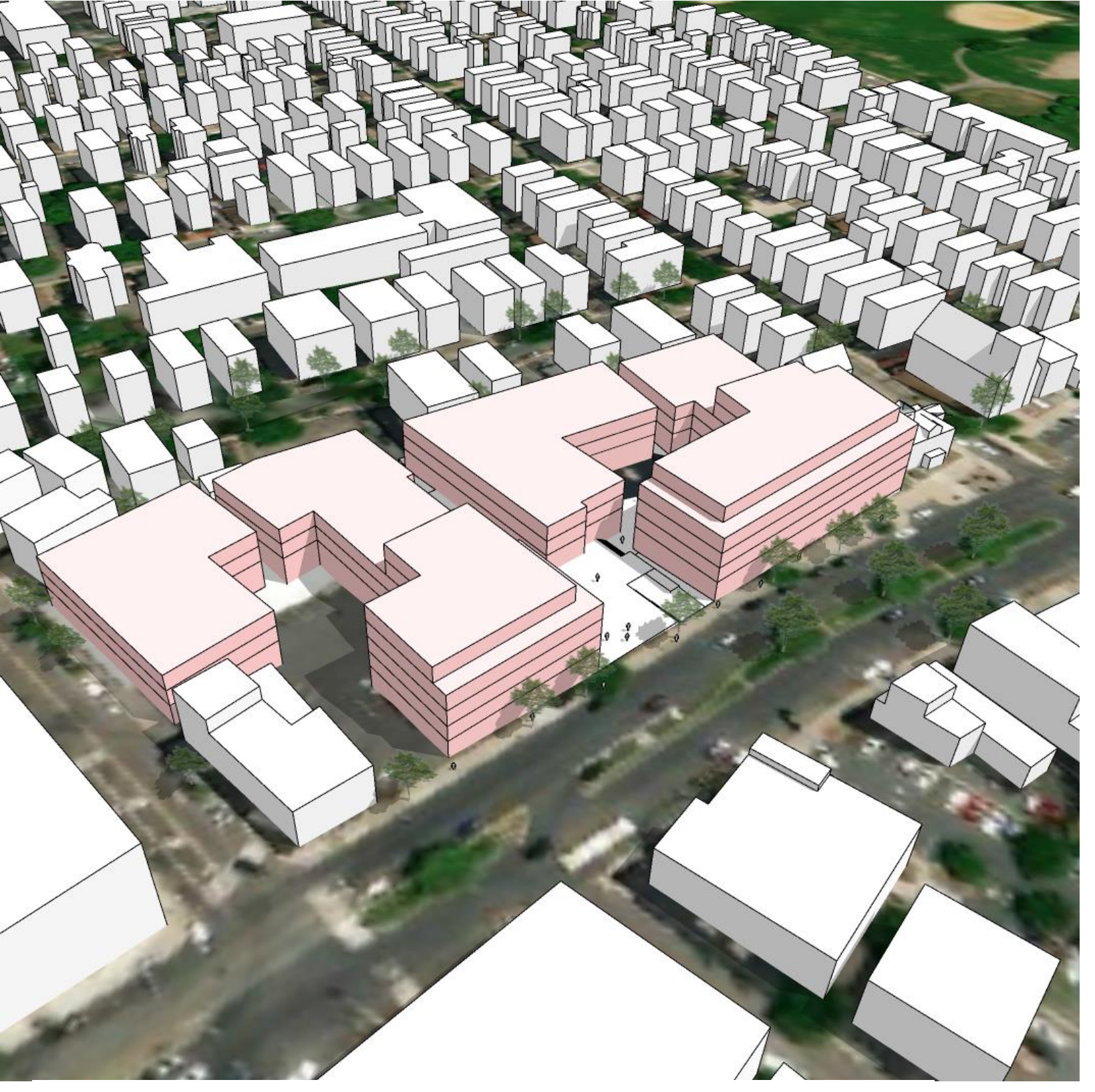
5 story scheme - Front (From Broadway)