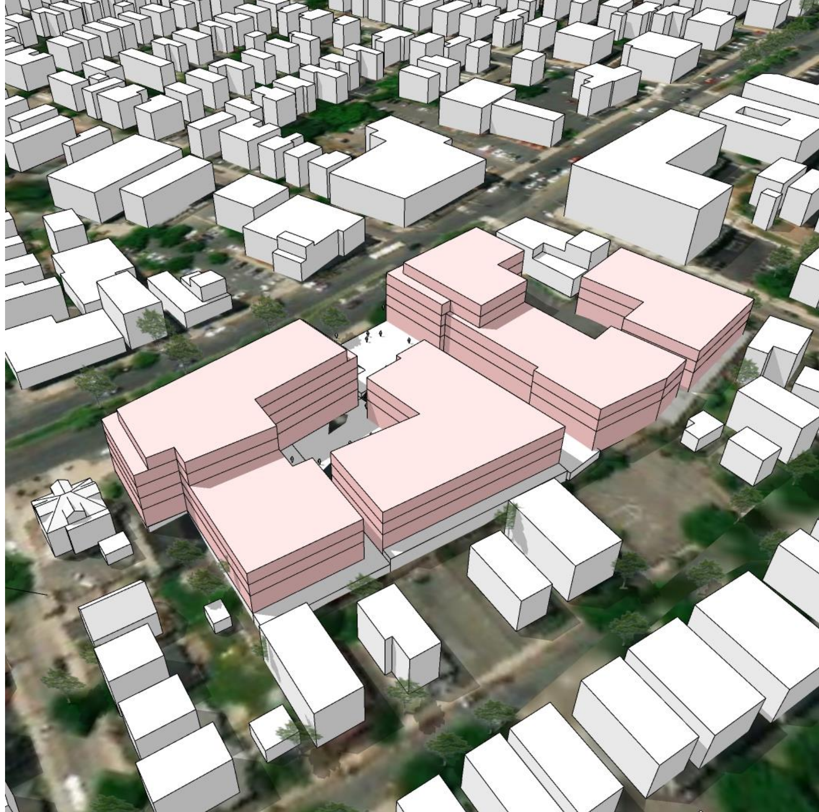
5 story scheme - Back (From Sewall)